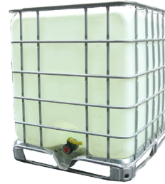
Example of an IBC

1,000 kg (1 tonne). IBCs are also available in lesser capacities. It is also advised to fill the IBC to the top with water to avoid liquid movement, as would happen if only partially full.