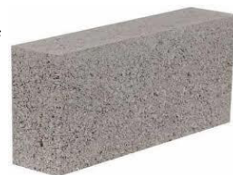
100 x 220 x 450 mm solid concrete building block

Your vehicle must meet the minimum real total mass requirements, i.e. real total mass is the weight of a vehicle including the load, if any, which is on it.